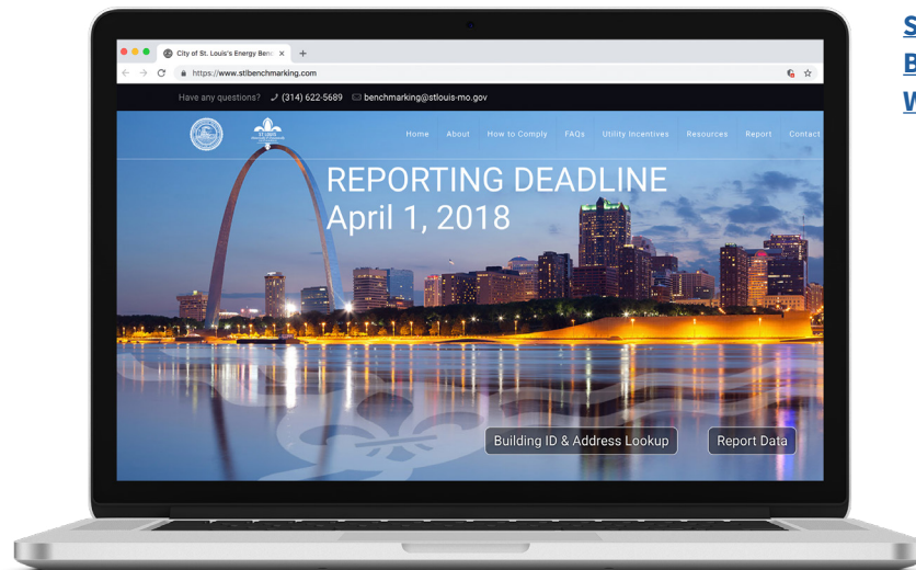
ST. LOUIS BENCHMARKING WEBSITE

The typical cost of a website can range from staff time to produce an internal website on a city site, to a few hundred dollars to purchase a domain URL and basic, template design theme via a content platform such as WordPress, to tens of thousands of dollars to more customized options, depending on the types of functionalities needed to operate the site. Often specialty design and custom site features run at greater costs than using an existing city government’s website system. The level of complexity also affects timing as the more complex the site, the more time needed for creation. Often, a basic site can suffice for launching a program, as long as it contains critical information about what the program is, when deadlines are, and what action people need to take to engage or participate.